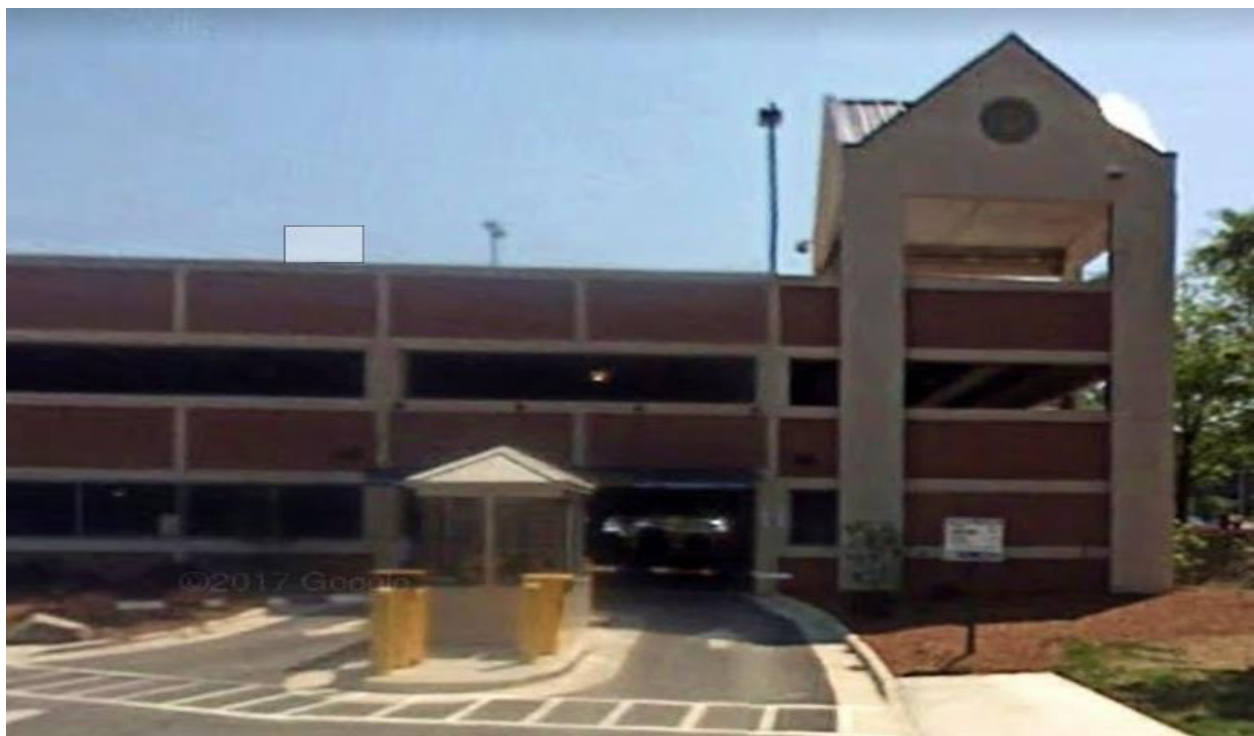
Obermeyer Parking Garage (Laurel St)

Next on your right, is Obermeyer Parking Deck. You will need to park there. (See Map)